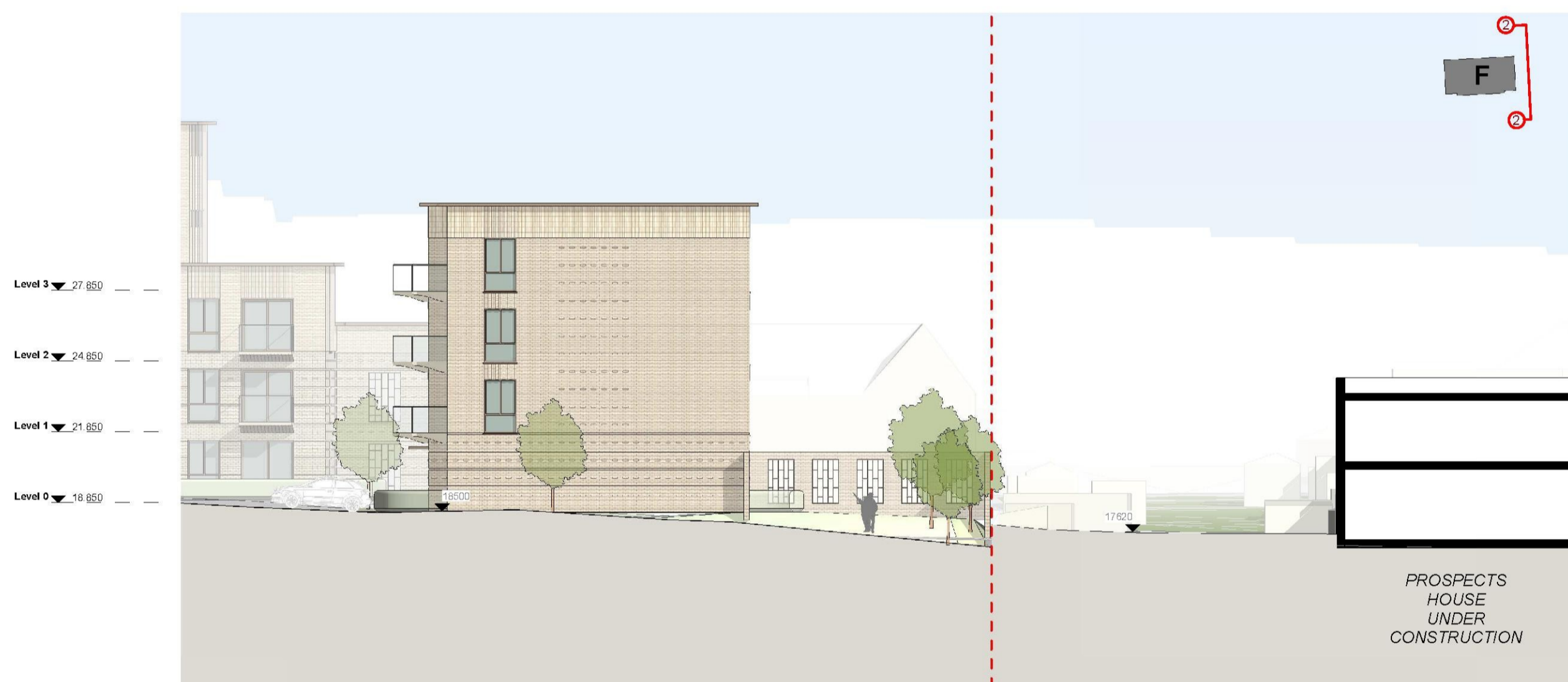
2 East Elevation 1:200