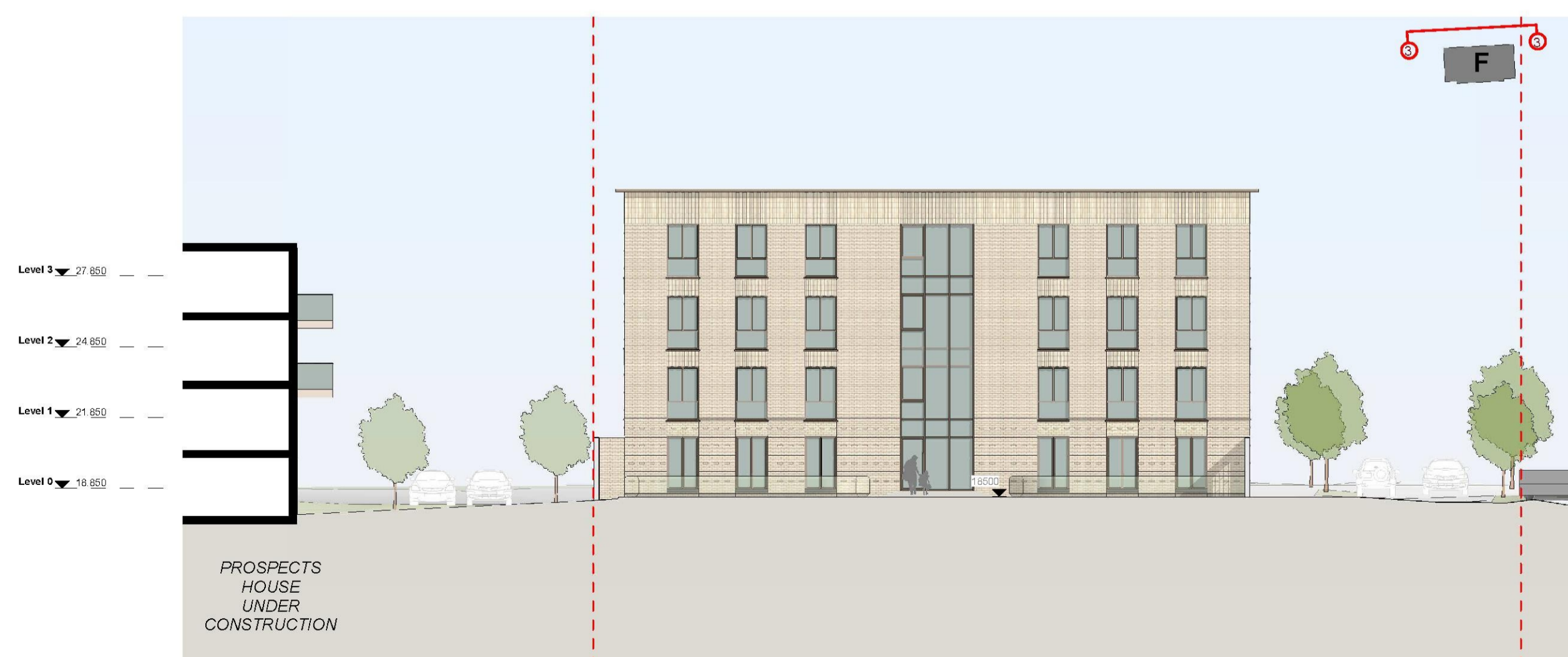
3 North Elevation 1:200