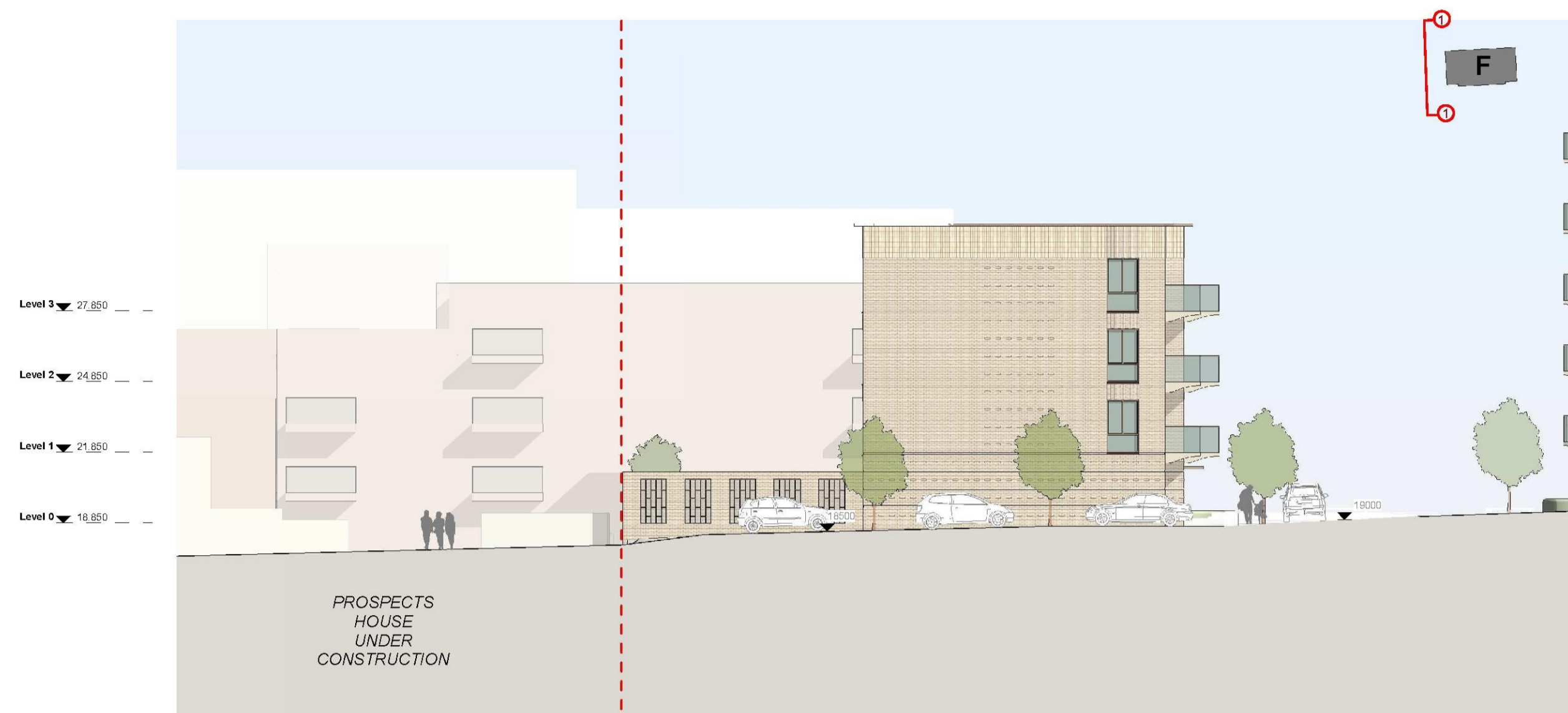
1 West Elevation 1:200