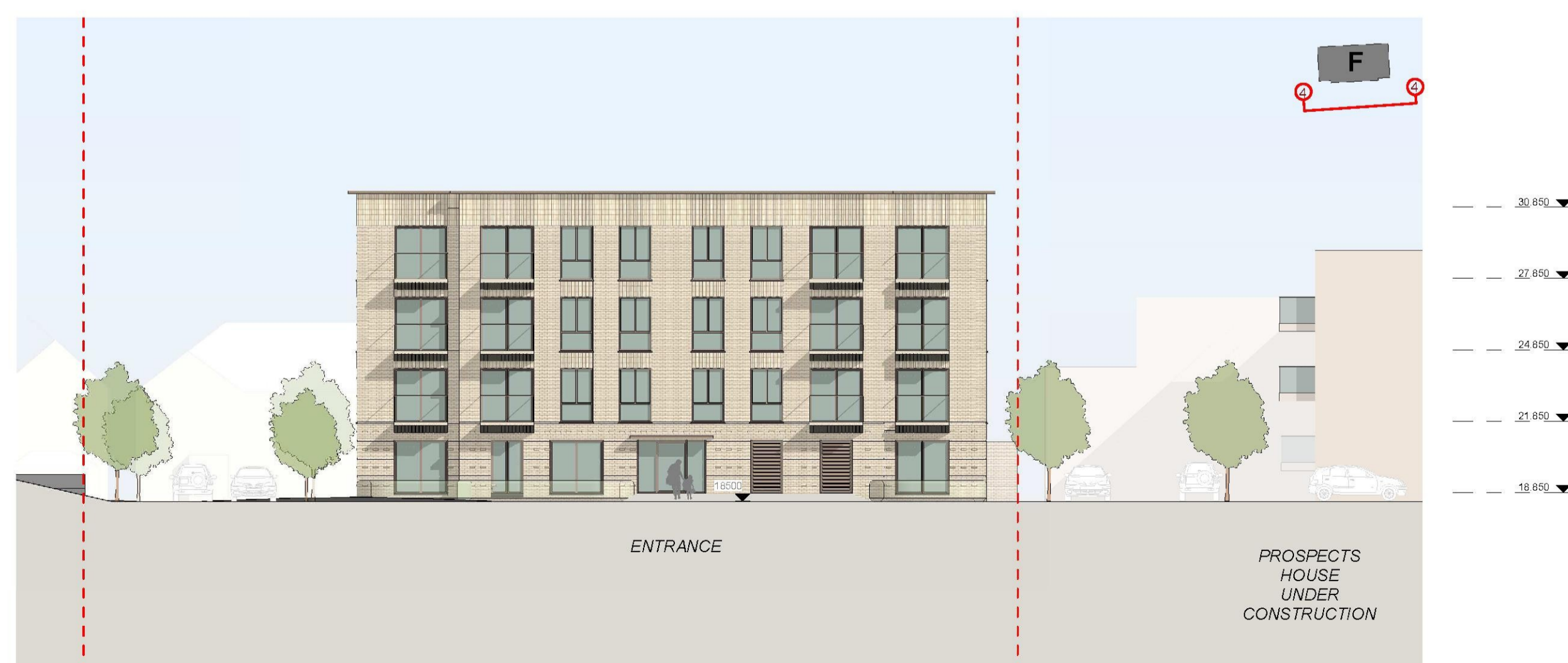
4 South Elevation 1:200

Rev: P01 Date: 13.09.2019 Drw: FD Chk: SG Planning Issue